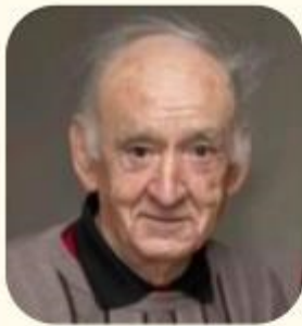
Willie Doyle Green Road Portlaoise